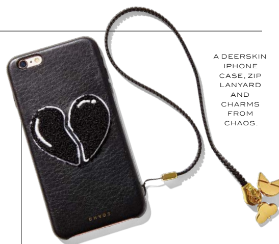
A DEERSKIN IPHONE CASE, ZIP LANYARD AND CHARMS FROM CHAOS.