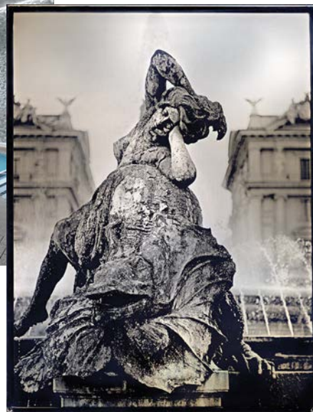
KARL'S KINGDOM Karl Lagerfeld (top) incorporated his own photographs of Roman fountains (above) into his design for the lobbies at Miami's Estates at Acqualina.