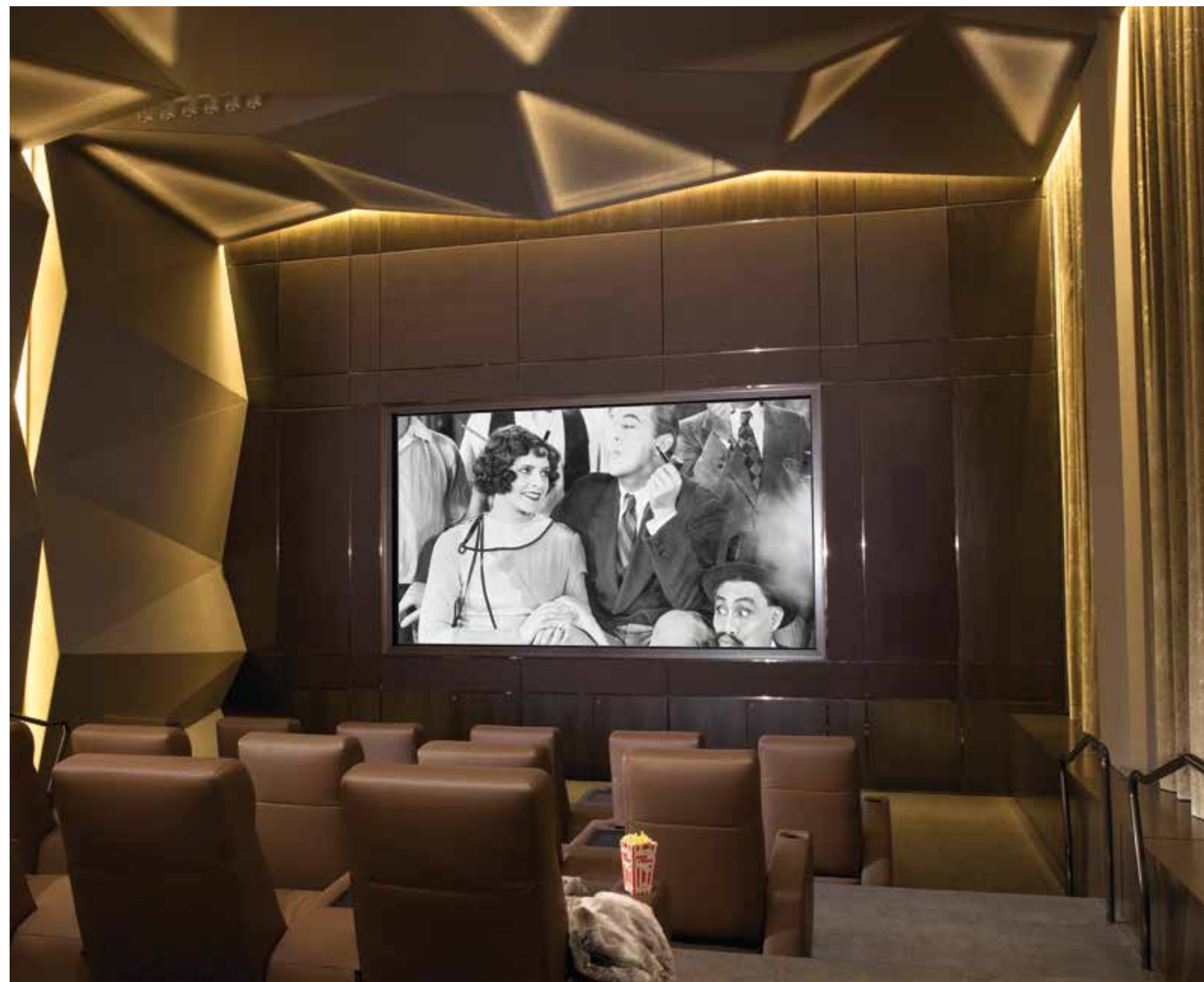
The ON-SITE MOVIE-SCREENING room