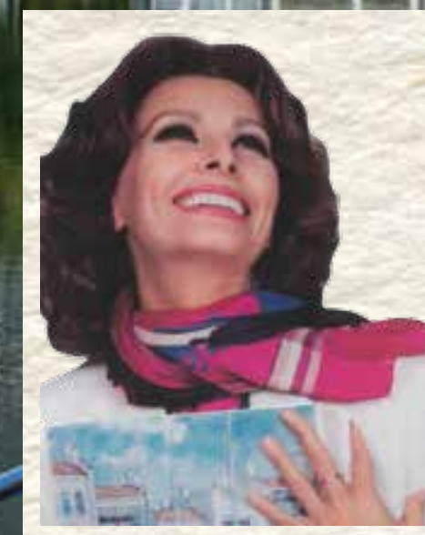
SOPHIA LOREN, spokesperson for WILLIAMS ISLAND