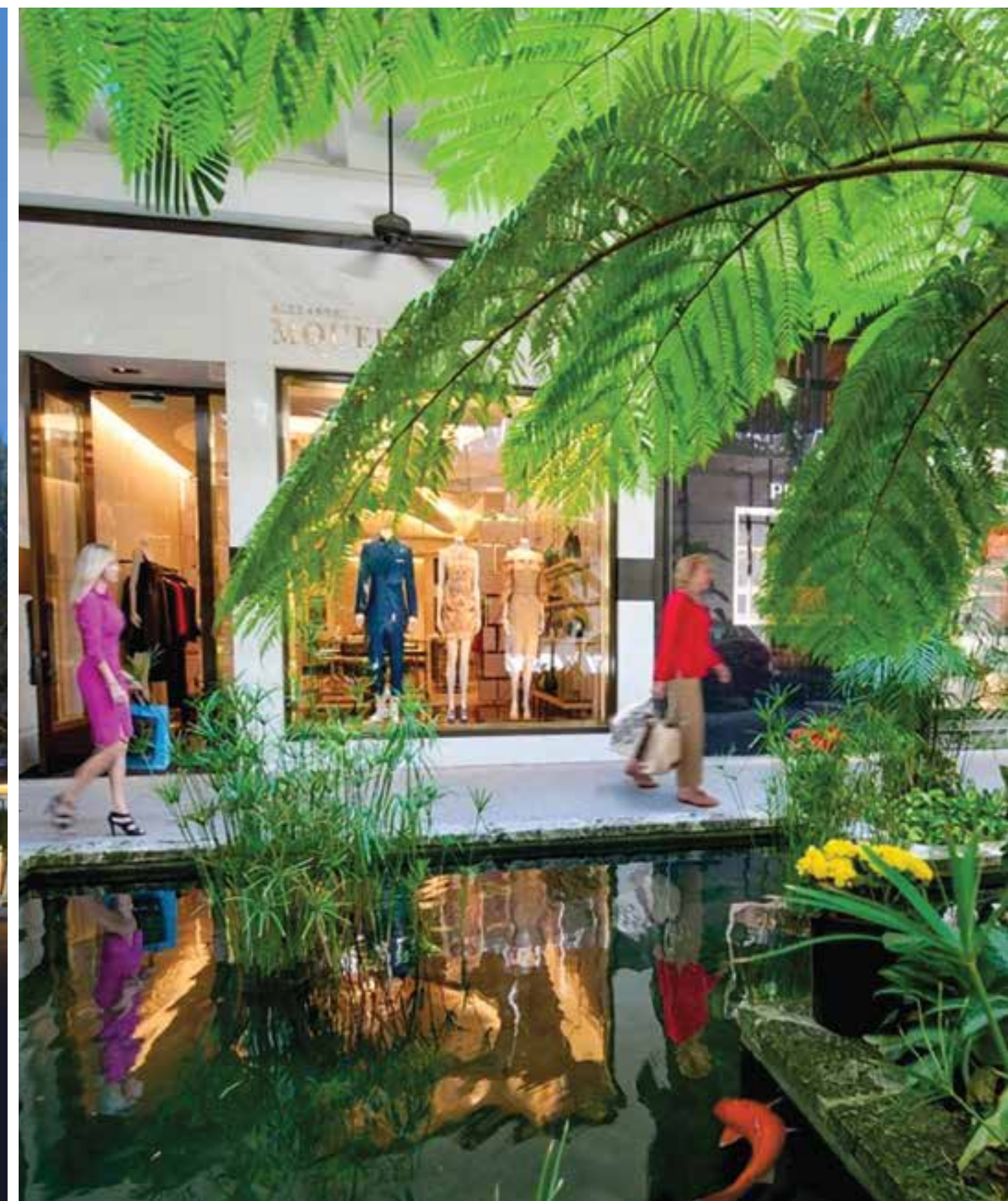
BAL HARBOUR Shops