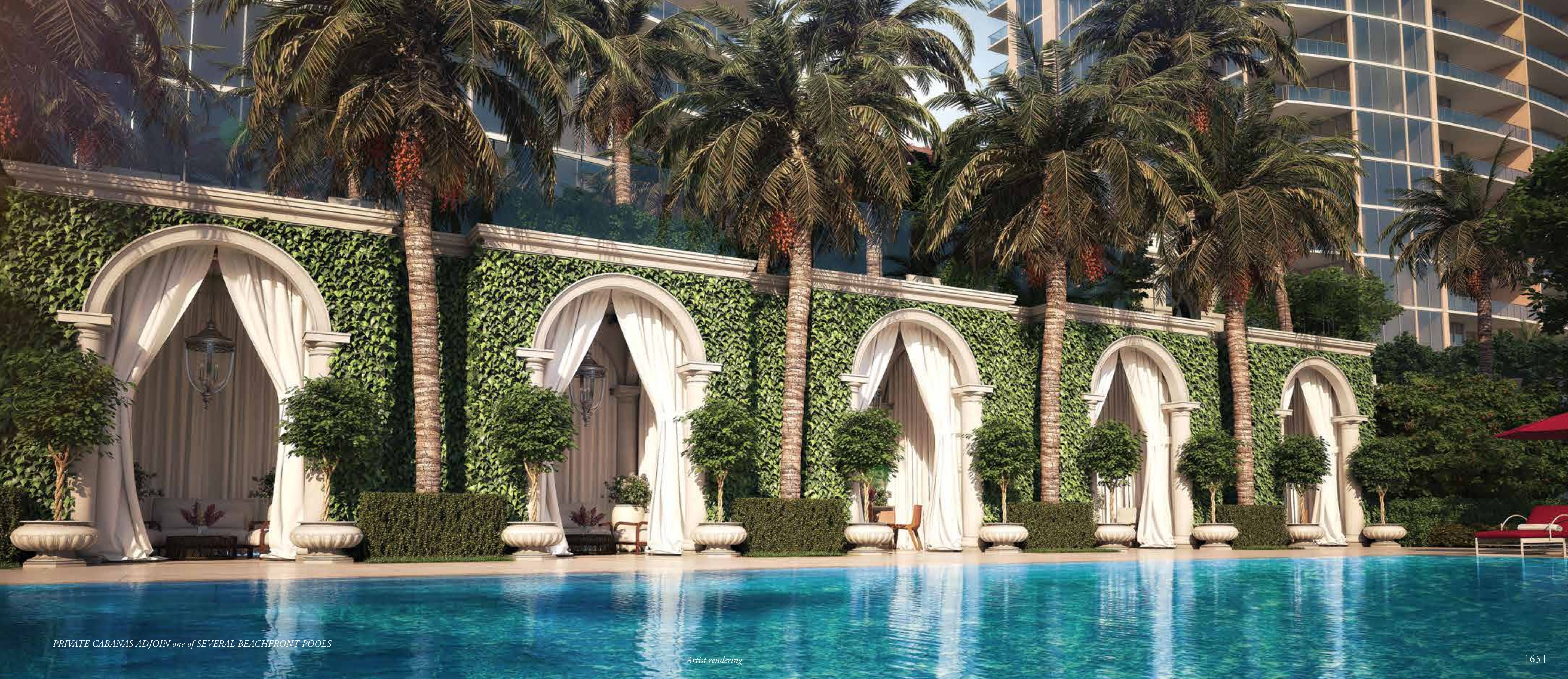
PRIVATE CABANAS ADJOIN one of SEVERAL BEACHFRONT POOLS