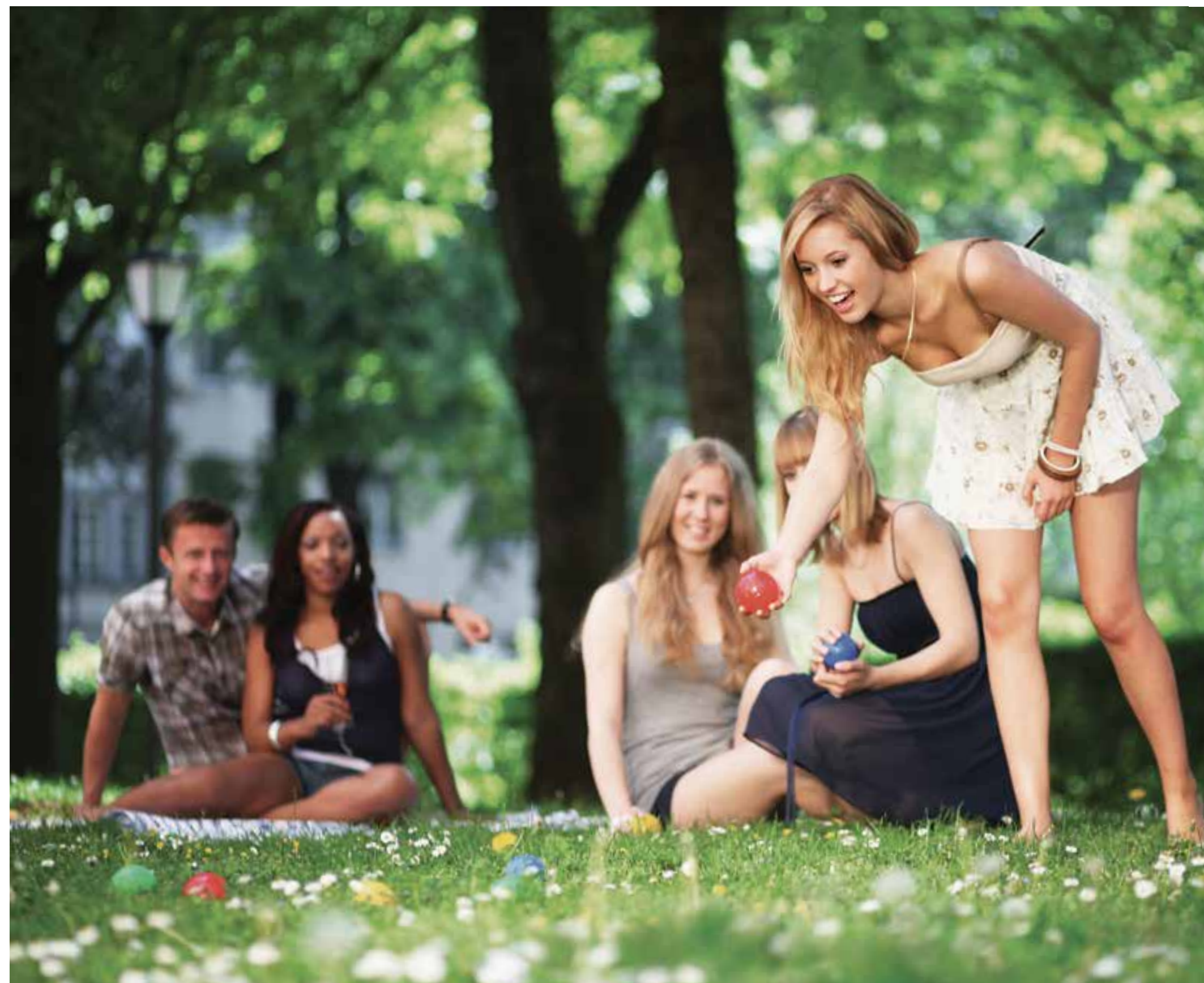
The BOCCE LAWN