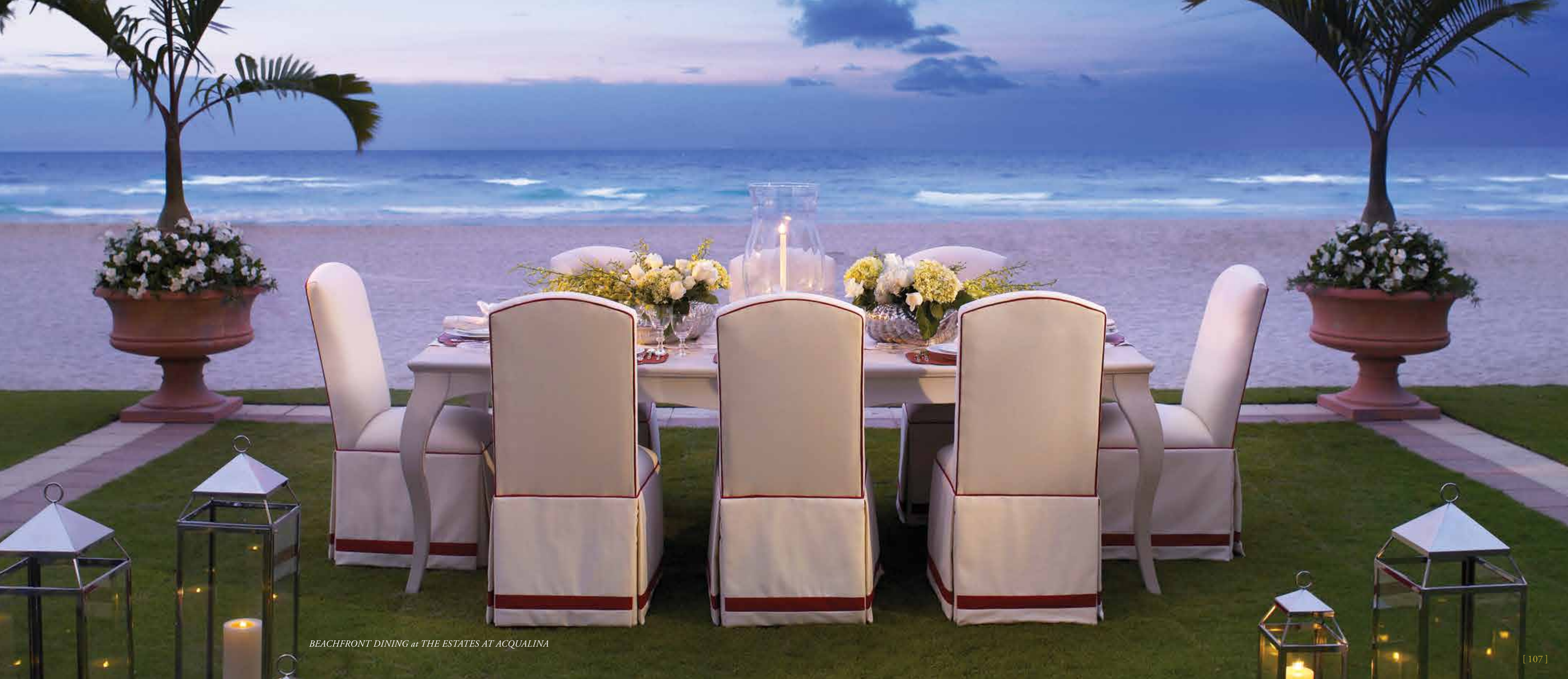
BEACHFRONT DINING at THE ESTATES AT ACQUALINA