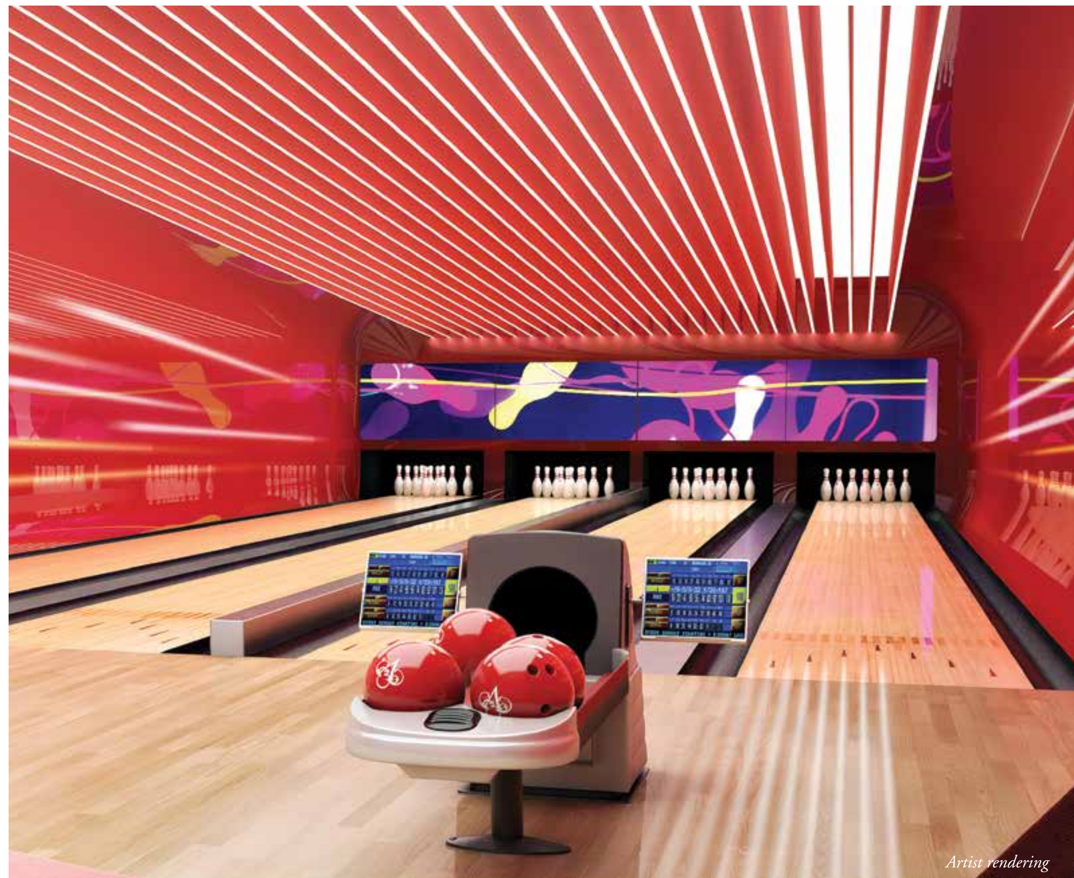
VILLA ACQUALINA features FOUR BOWLING LANES