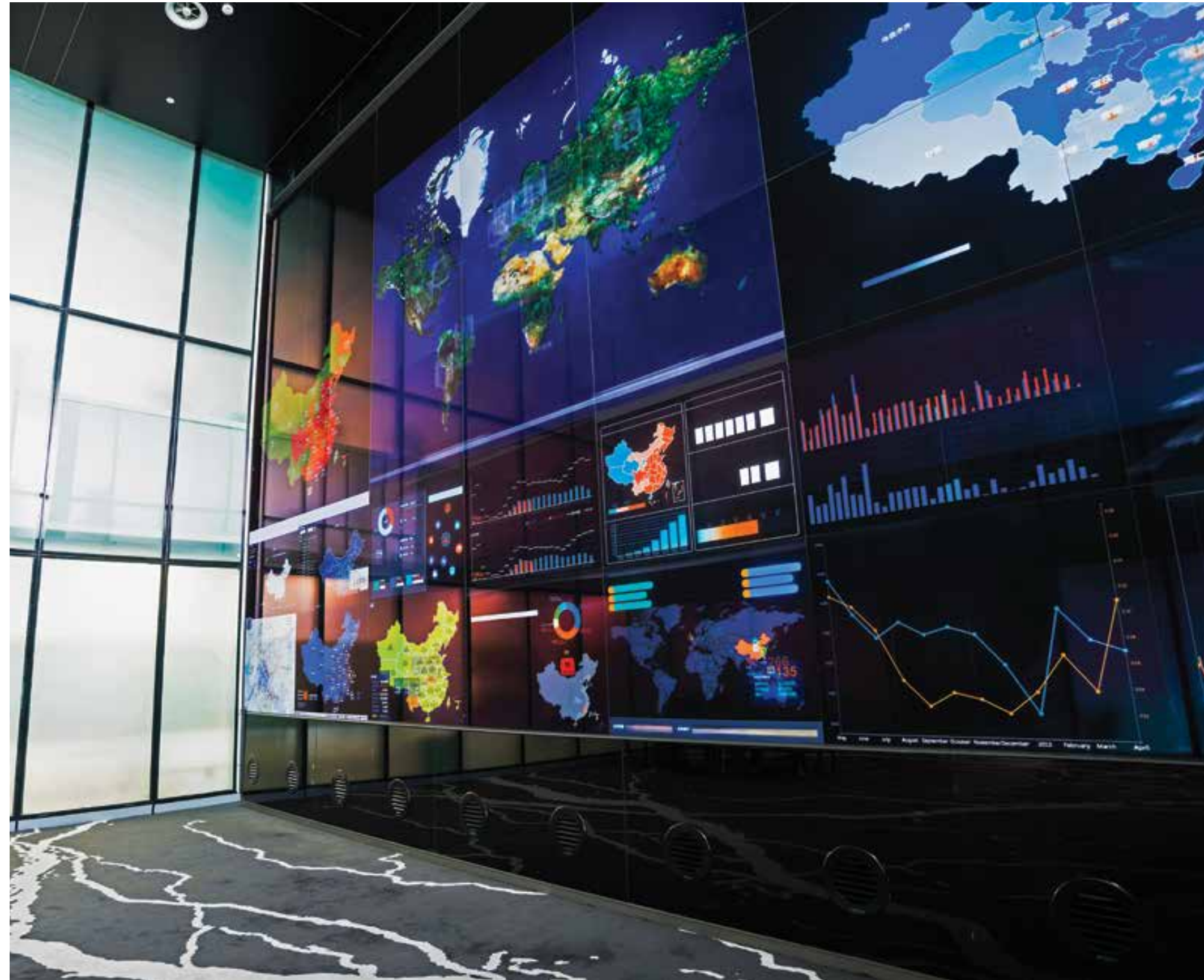
The WALL STREET TRADING ROOM, where you can buy, sell and trade