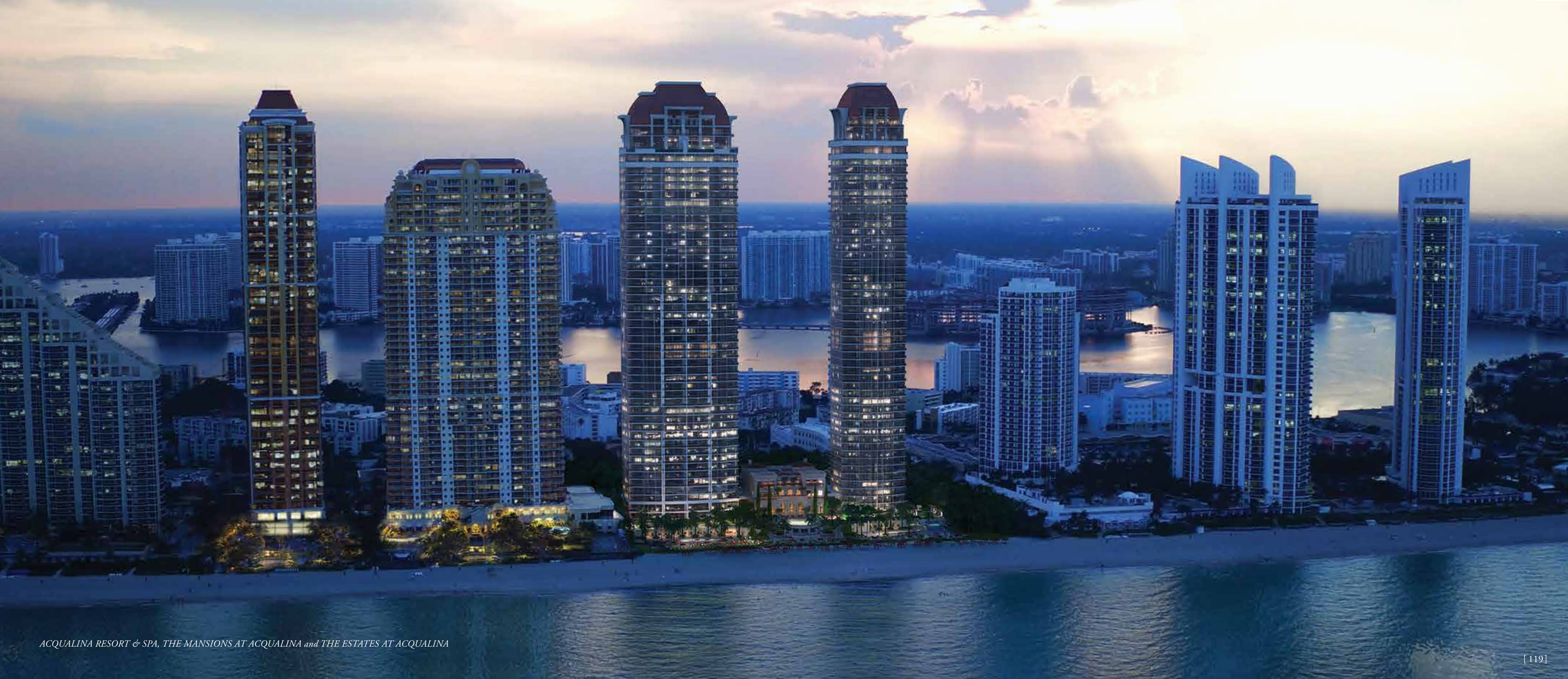
ACQUALINA RESORT & SPA, THE MANSIONS AT ACQUALINA and THE ESTATES AT ACQUALINA