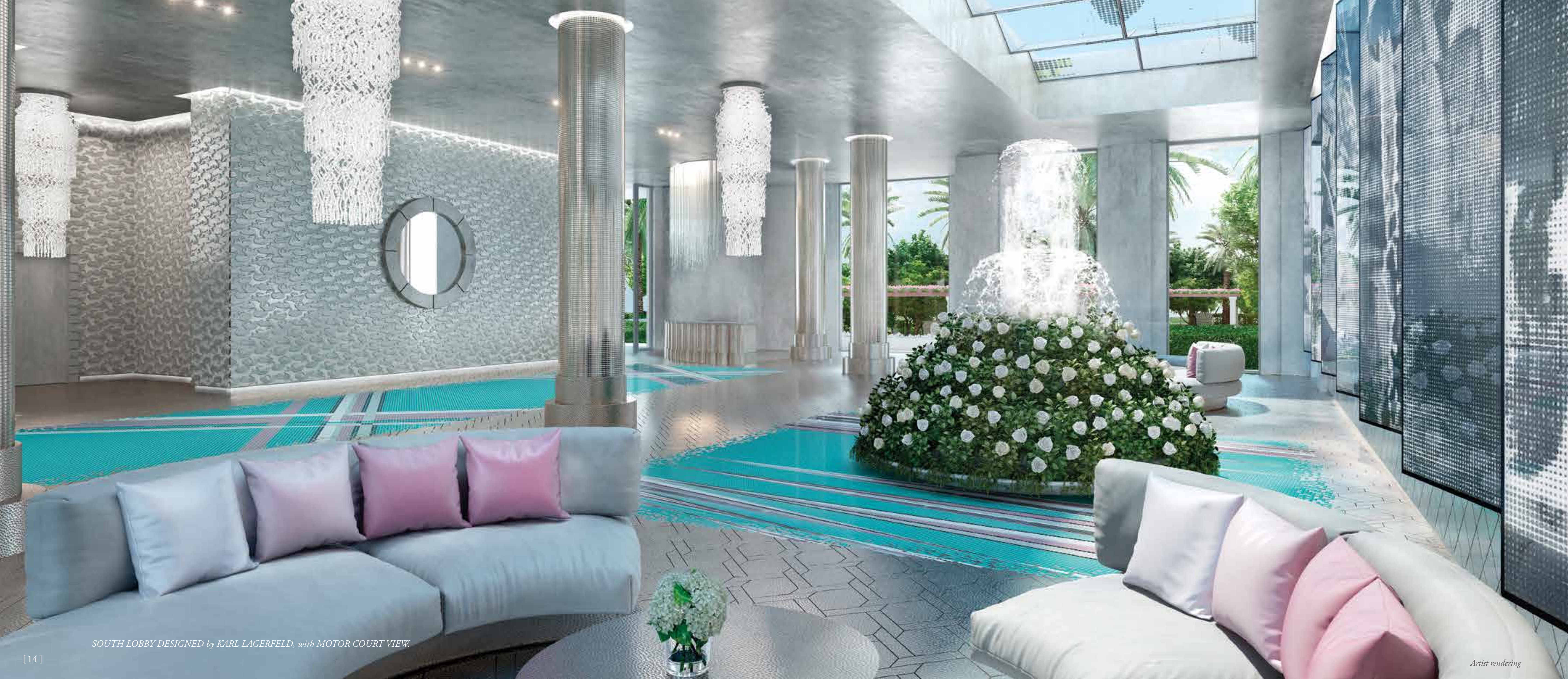
SOUTH LOBBY DESIGNED by KARL LAGERFELD, with MOTOR COURT VIEW.