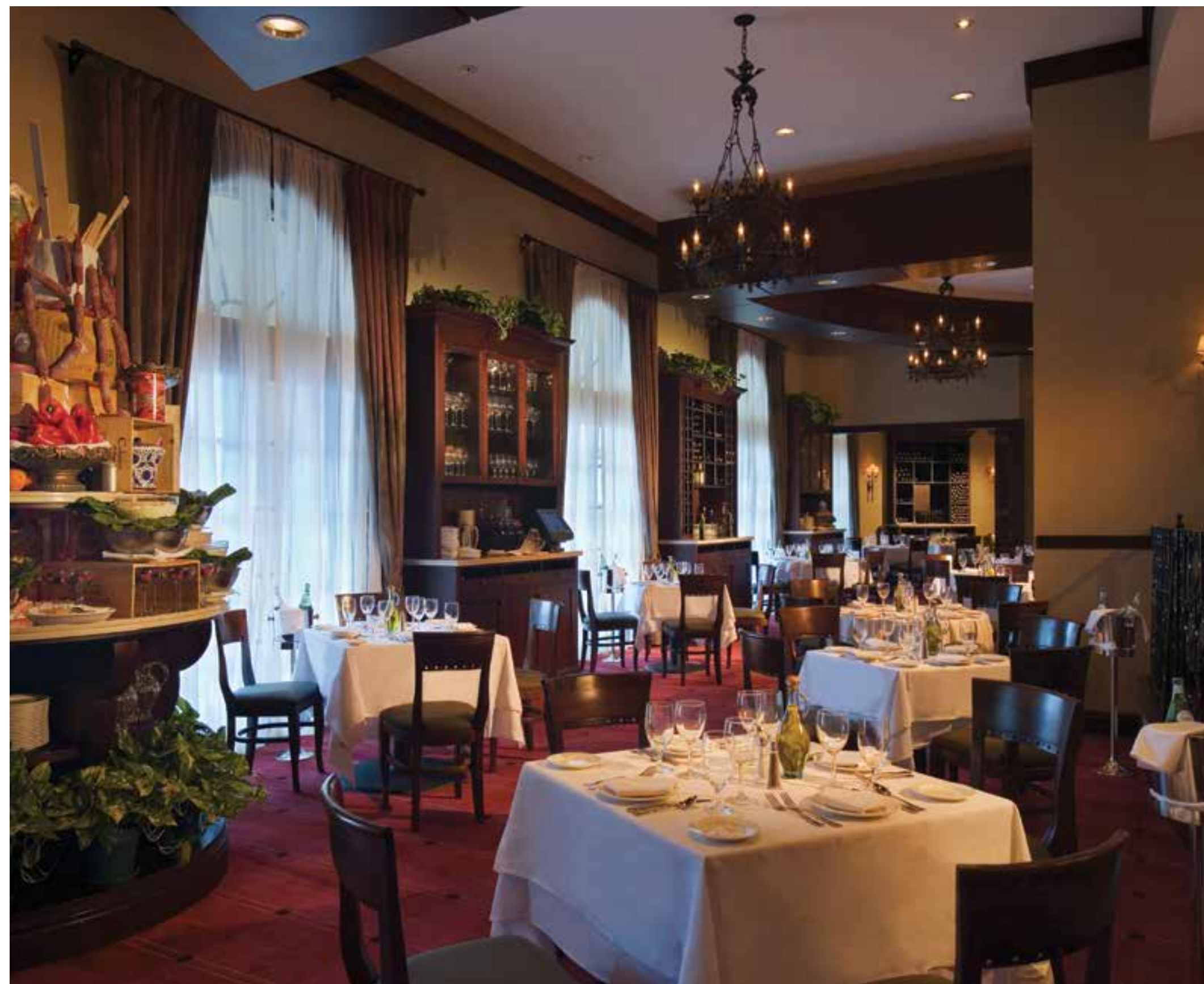
IL MULINO NEW YORK RESTAURANT